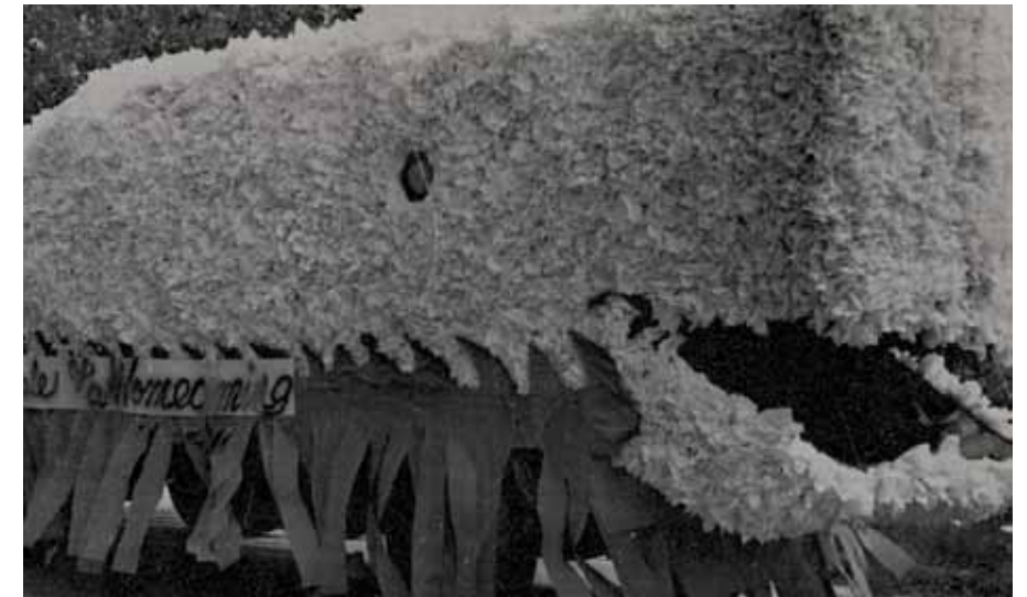
Kappa Sigma Nu’s 1957 Homecoming Parade-winning whale float.

“Later that night, after the parade, one of the guys was a little tipsy and wanted to drive the whale.”